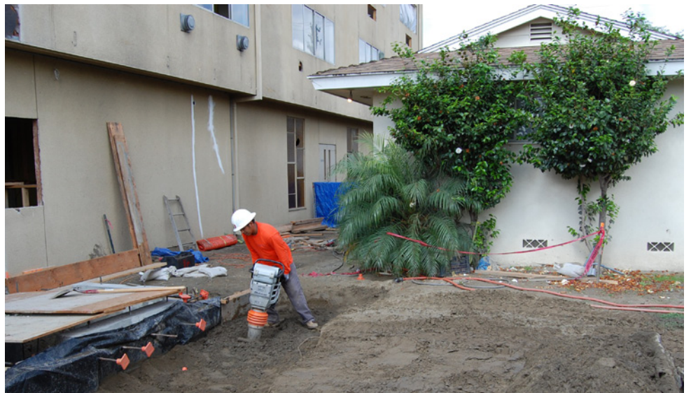
The Carpenter is using a "jumping jack" compactor to compact the back filled soil.

Scripture, prayer and the Eucharist are the precious treasure enabling us to grasp the beauty of a life spent fully in service of the Kingdom.