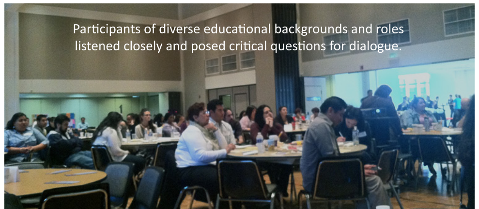
Participants of diverse educational backgrounds and roles listened closely and posed critical questions for dialogue.

✦ Make recommendations for improvements in the preparation of