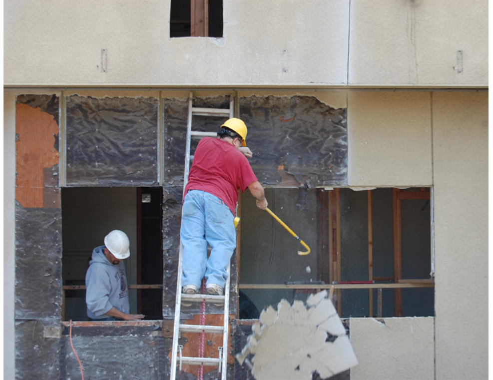
The Carpenters are removing the stucco and opening the wall for the elevator structure.

The work for next week is the installation of the window smoke detectors located on each of the South side windows. The purpose of the smoke detectors is so that in cases of a fire, the windows will close automatically protecting the occupants.