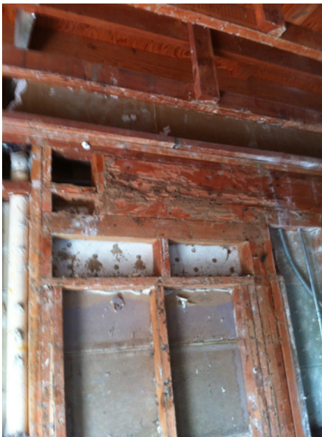
Termites - The wall separating the dining room and kitchen needs to be treated for termites. The red area is termite invested.